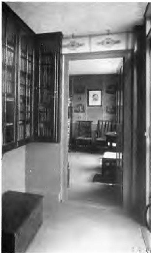
THE SMALL ENTRY WHERE THE VALUABLE BOOKS WERE KEPT